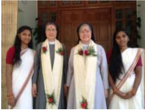
Friendly Visit to Punalur