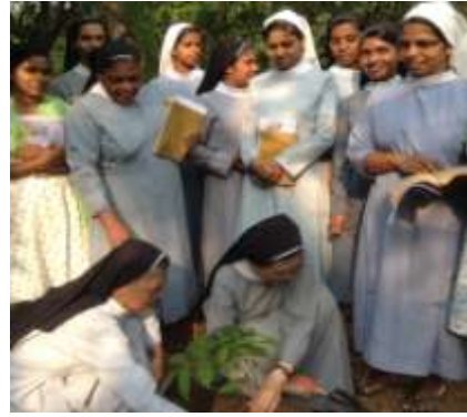
March 29 – April 4, 2019